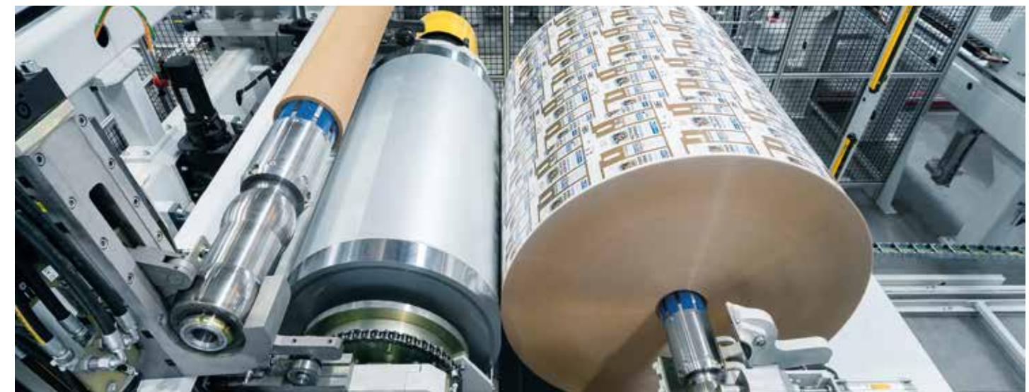
Winding unit W1800